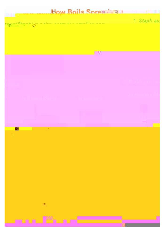
<u>Figure S1: Educational materials supporting boilsprevention practices and distribution of household kits in a remote Alaska Native community—Alaska, 2016</u>